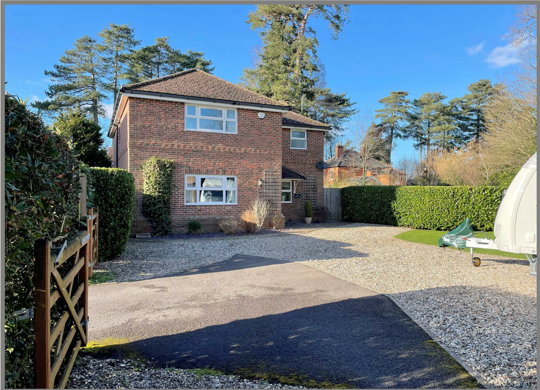
TALL TIMBERS, Sutherlands, Newbury, RG14 7RL